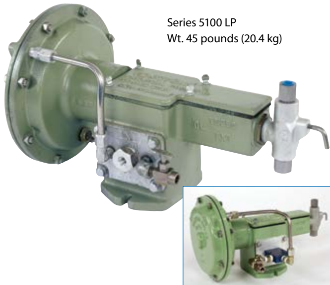
Series 5100 LP Wt. 45 pounds (20.4 kg)